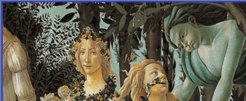
Allegoria della Primavera, by Sandro Botticelli, tempera on panel, Museo degli Uffizi, Florence (concession of the Ministry for Cultural Assets and Activities)