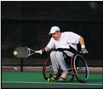
Individual 40 years post tetraplegia returning to tennis after heart attack in 2014

Blood pressure is another indirect measure of the CVD status of the individual with SCI. The baseline or resting value for blood pressure recommended to start pharmacological treatment for able-bodied patients over 60 years is systolic blood pressure (SBP) >150mmHg and diastolic blood pressure (DBP)